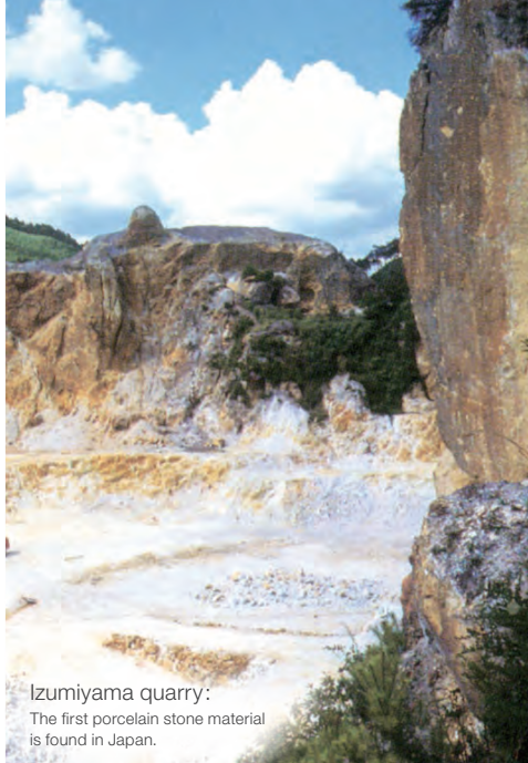
Izumiyama quarry: The first porcelain stone material is found in Japan.