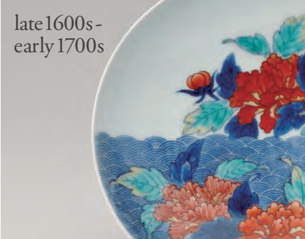
late 1600s - early 1700s