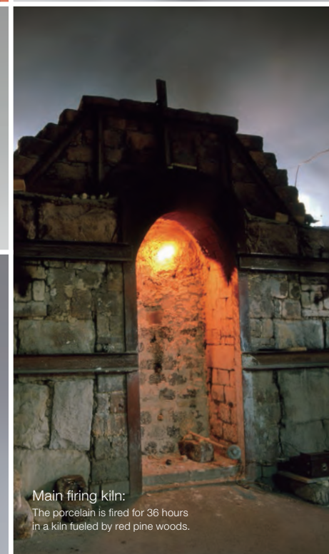
Main firing kiln: The porcelain is fired for 36 hours in a kiln fueled by red pine woods.